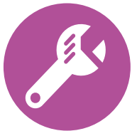
SERVICE REQUEST AND INSTALLATION SITES MANAGEMENT