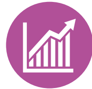
CUSTOMER SERVICE MANAGEMENT