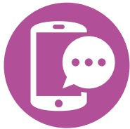
REQUEST AND CALL MANAGEMENT